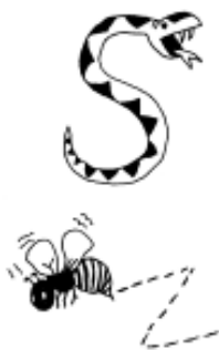
Figure 1. An example of pictures of sound personalities incorporating letter-shape association.

This is probably best done by associating phonemes with a creature, an action, or an object that is familiar to the child. For example, the phoneme /s/ can be associated with the hissing sound a snake makes – sssssss. A sound personality can be created by calling /s/ the "Sammy snake" sound. Many sounds have natural associations, such as a crowing rooster for /r/, a buzzing bee for /z/, and the "be quiet" sound for /sh/.